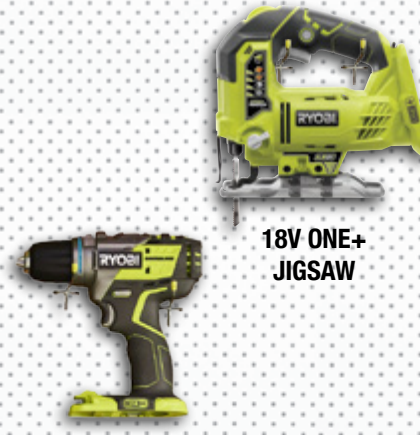
18V ONE+ DRILL DRIVER